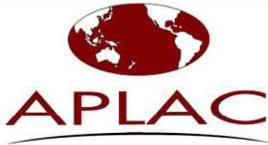
Asia Pacific Laboratory Accreditation Cooperation