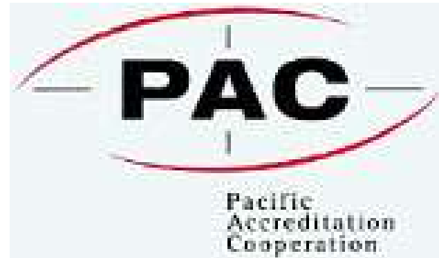
Pacific Accreditation Cooperation