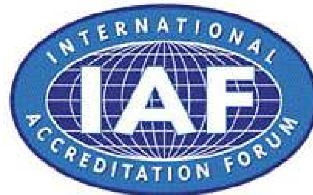
International Accreditation Forum